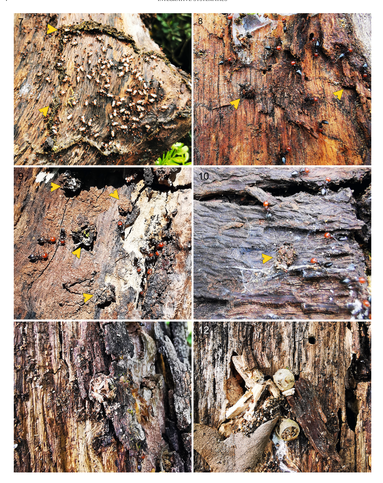
Figs. 7–12. Italochrysa italica (Rossi) larvae in nature, within nests of Crematogaster scutellaris (Olivier). – 7. Brood chamber of ant nest 1. 8 . Two larvae in nest 1. 9 . Four larvae resting in proximity of nest 2. 10 . Larva moving away from ant workers. 11 . Larva with debris packet made of wood fragments. 12 . Old empty pupal cocoons of I. italica in nest 3. Yellow arrows indicate camouflaged chrysopid larvae.