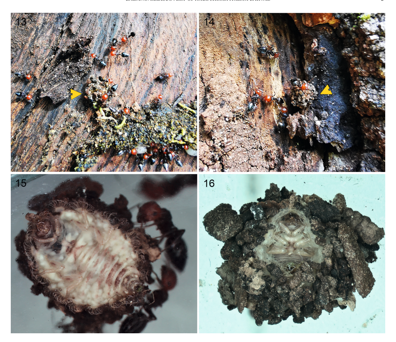
Figs. 13–16. Interactions between Italochrysa italica (Rossi) and Crematogaster scutellaris (Olivier). – 13–14. Ants investigating chrysopid larvae in nature. 15. Laboratory interaction between 3rd instar I. italica larva and worker ants, showing larva firmly adhering to petri dish cover while being checked out by ants. 16. Harassed larva showing its ability to partly roll into a defensive ball. Yellow arrows indicate camouflaged chrysopid larvae.

terranean chrysopids by the synapomorphies of the tribe, i.e., i) antenna robust, partly withdrawable within cranium; ii) L1 with two apical sensilla; iii) mandible robust, shorter than head capsule length; iv) second labial palpomere stout, shorter than first and second palpomeres combined; v) thoracic sclerites reduced; vi) L1 with setae of lateral tubercles rough (see also Tauber et al. 2021). Italochrysa stigmatica (Rambur, 1838) is the only other European species of this genus, being present in the Iberian Peninsula and marginally in southern France (OSWALD 2022). The first instar of this species was